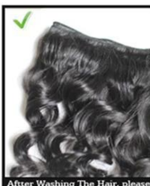
Aftter Washing The Hair, please Nurse With SomeHair Oil, then The Hair Will Be Silky And Soft.

Secondly, After wash pls nurse the hair with some hair oil, then the hair will be silk and soft.