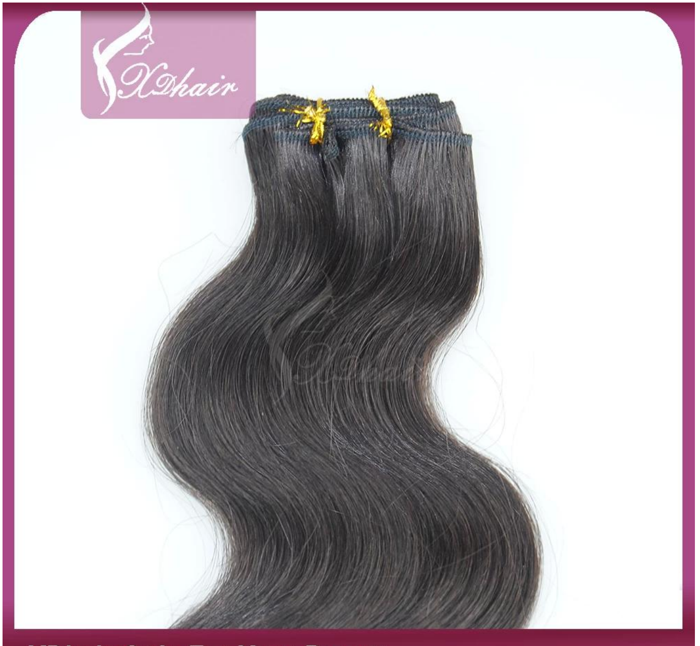
XDhair-Only For Your Beauty