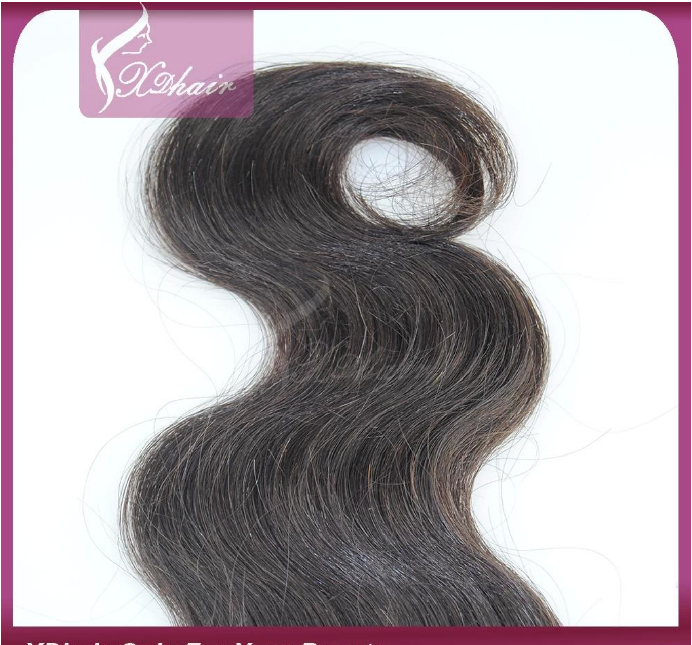
XDhair-Only For Your Beauty