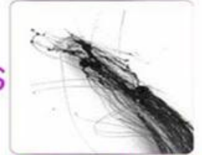
Chemical fiber hair

Burnig smells like a burnt fragrance, Human hair burns out very quickly, is also easily becomes ash.