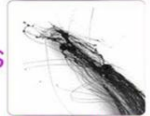
Chemical fiber hair

Burnig smells like a burnt fragrance, Human hair burns out very quickly, is also easily becomes ash.