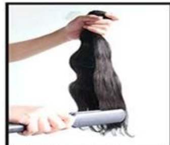
Too Much Heat May Damage The Hair.