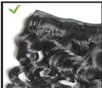
After Washing The Hair, please Nurse With Some Hair Oil, then The Hair Will Be Silky And Soft.

A: Firstly, PLS running the with your finers or Wide-toothed gently, to prevent the shedding. For curly hair, pls don't use the comb. Secondly, After wash pls nurse the hair with some hair oil, then the hair will be silk and soft.