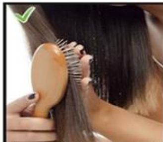
Choose The Wide-toothed Comb; Comb It Gently, so As To Prevent Shedding.