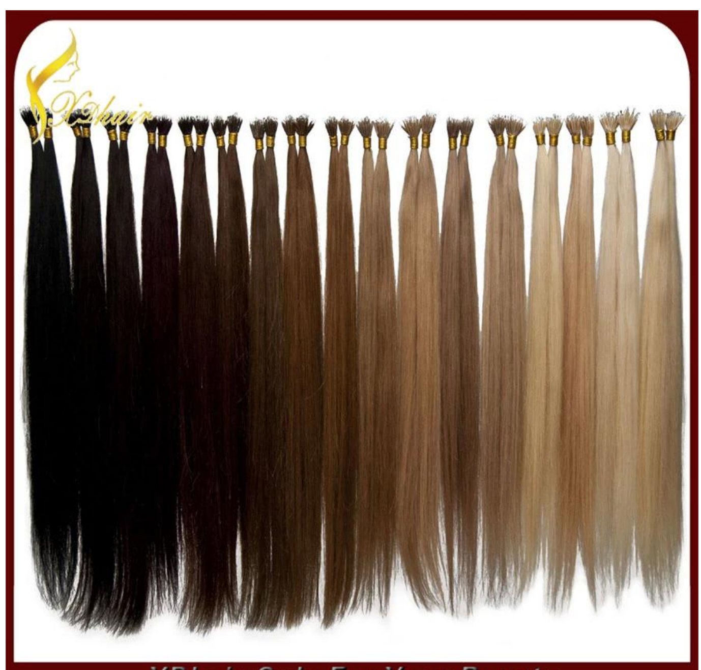
XDhair-Only For Your Beauty