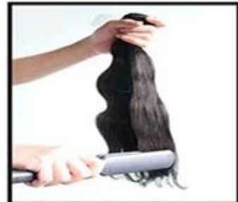
Too Much Heat May Damage The Hair.