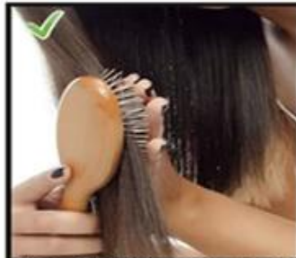
Choose The Wide-toothed Comb; Comb It Gently, so As To Prevent Shedding.