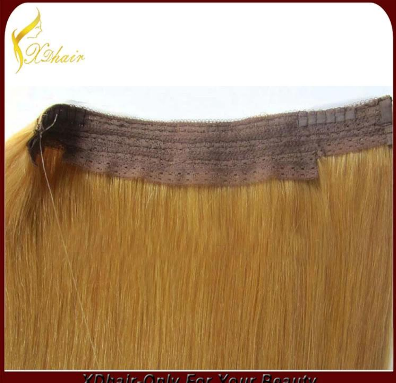
XDhair-Only For Your Beauty