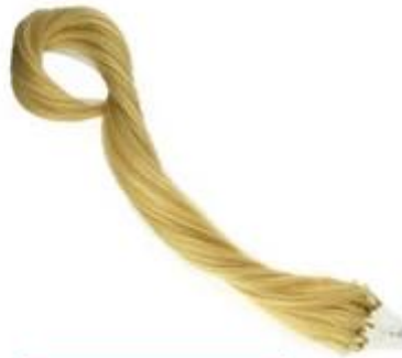
Micro ring hair