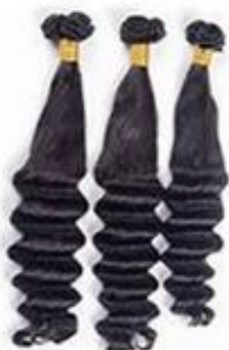
Funmi hair 1