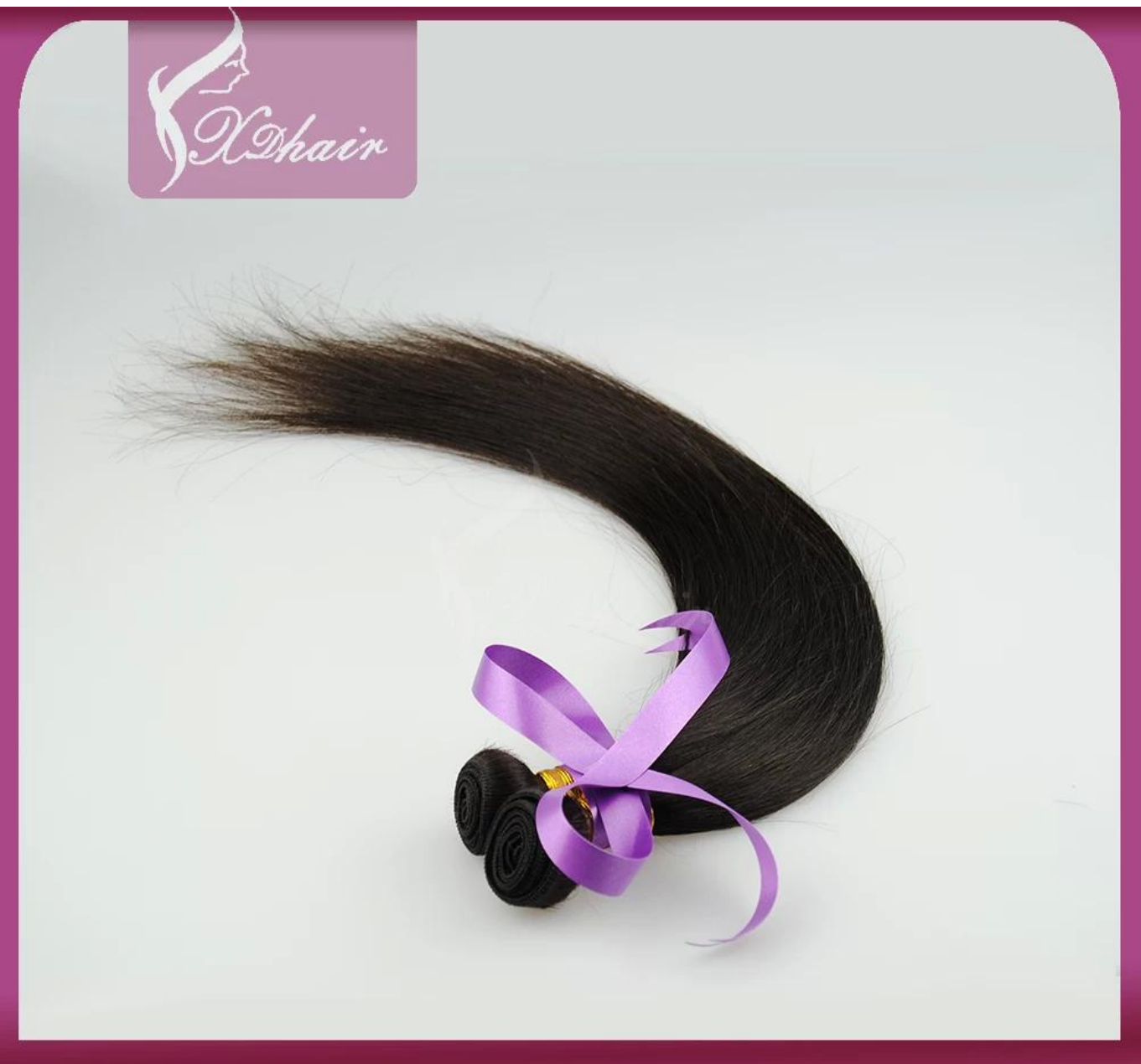
XDhair-Only For Your Beauty