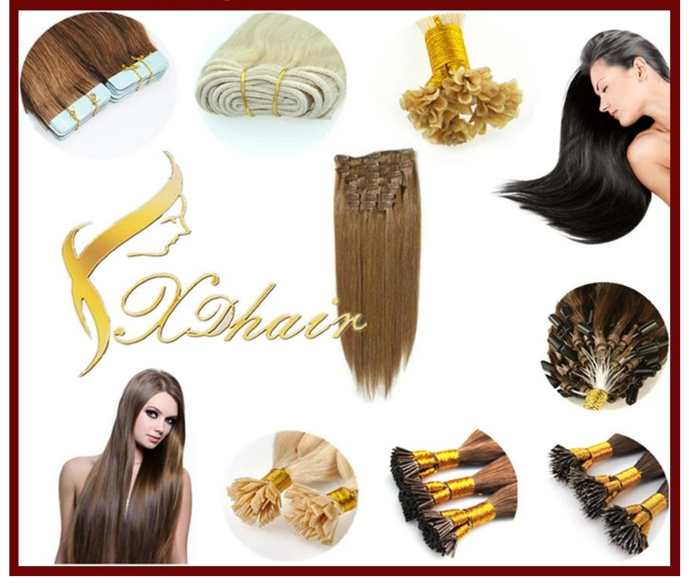
5A Unprocessed Length12"-24" 4pcs/lot Peruvian Virgin Hair Straight Human Hair Weft