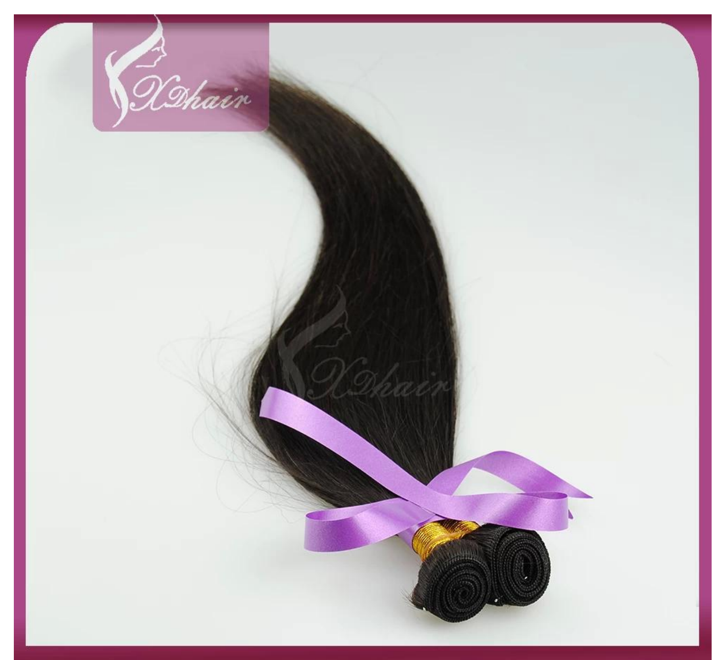
XDhair-Only For Your Beauty