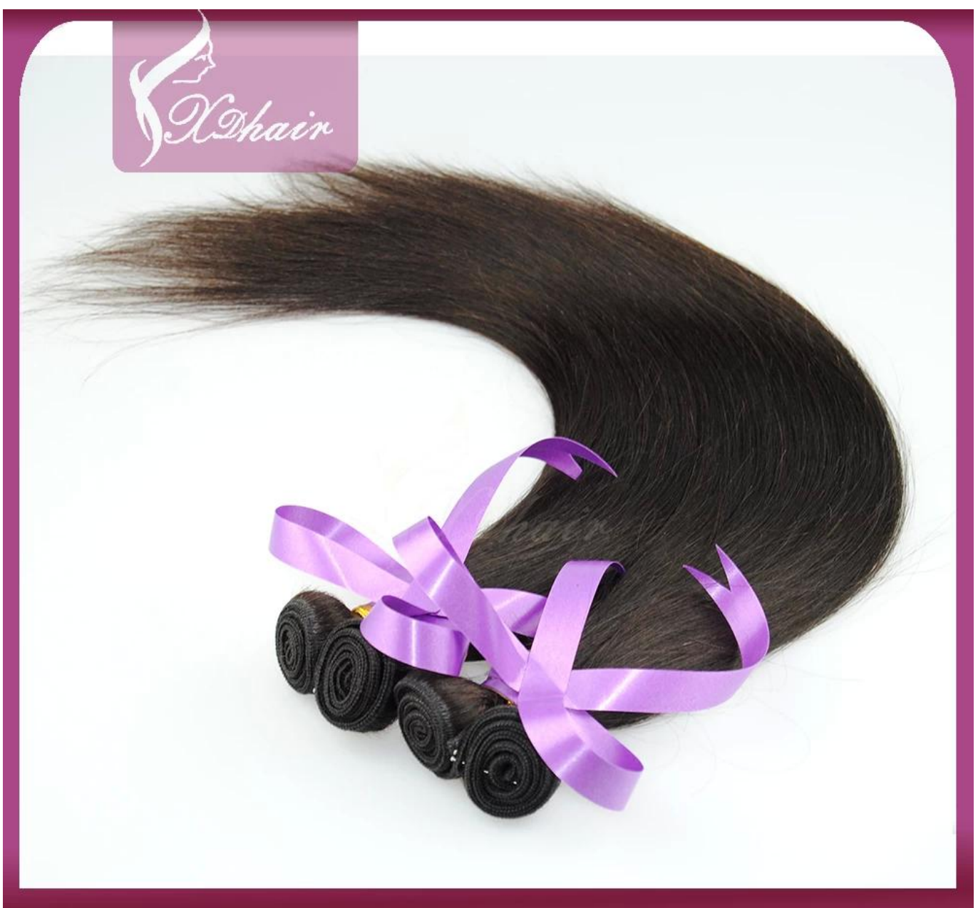
XDhair-Only For Your Beauty