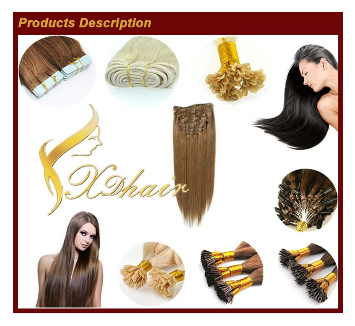
6A hot sale products Brazilian unprocessed hair weft extension