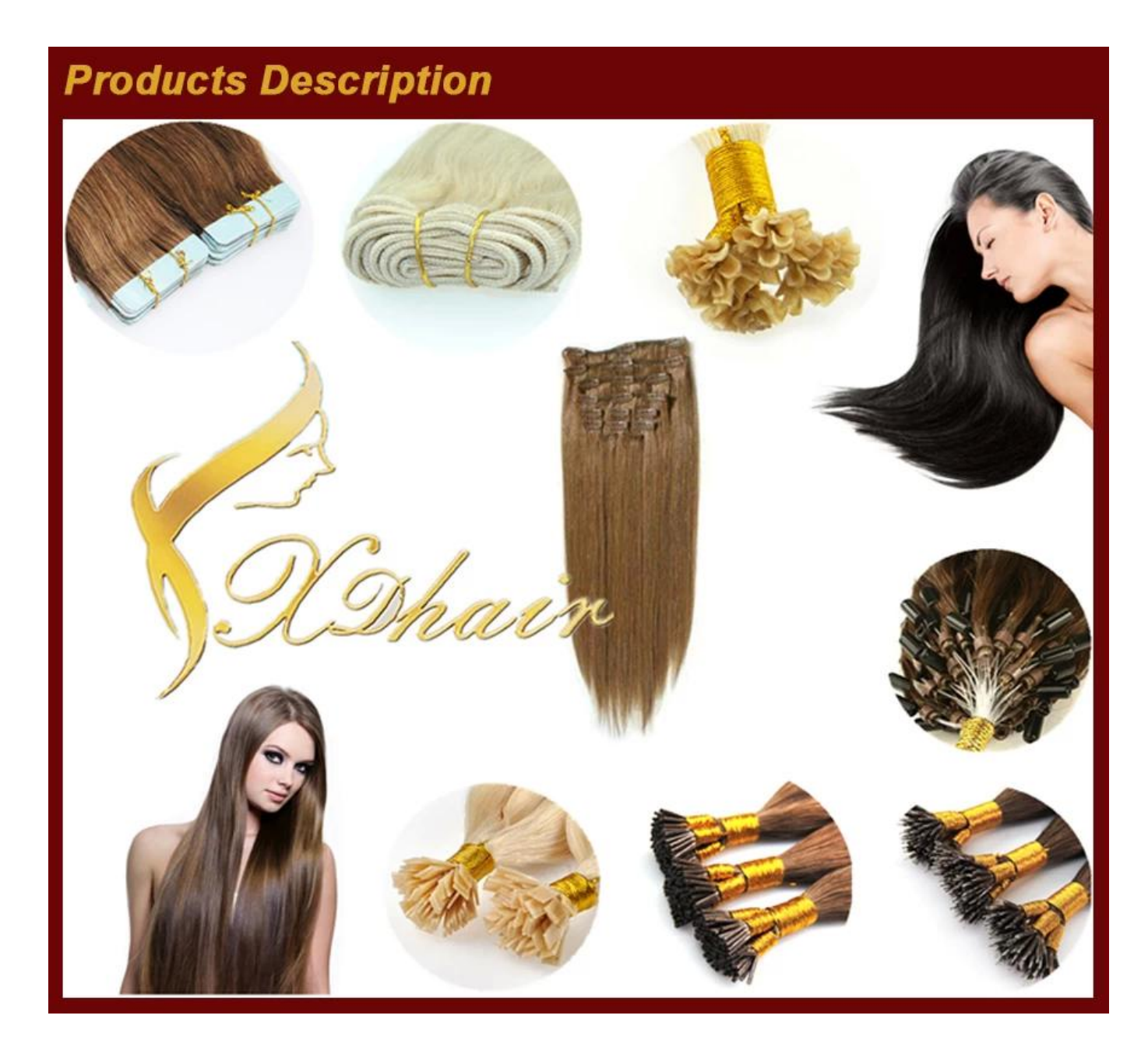
Best Selling Brazilian Virgin Hair Body Wave Unprocessed Human Hair Weft