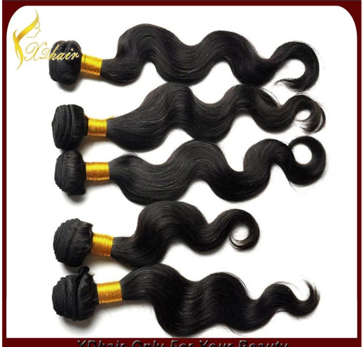
XDhair-Only For Your Beauty