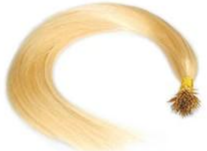
Nano tip hair