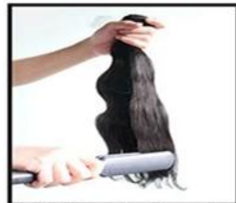
Too Much Heat May Damage The Hair.