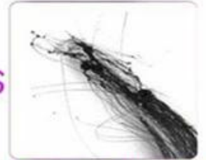
Chemical fiber hair

Burnig smells like a burnt fragrance, Human hair burns out very quickly, is also easily becomes ash.