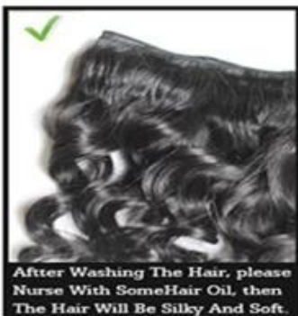
After Washing The Hair, please Nurse With Some Hair Oil, then The Hair Will Be Silky And Soft.

A: Firstly, PLS running the with your finers or Wide-toothed gently, to prevent the shedding. For curly hair, pls don't use the comb. Secondly, After wash pls nurse the hair with some hair oil, then the hair will be silk and soft.