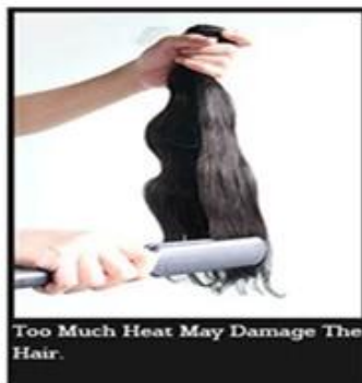
Too Much Heat May Damage The Hair.