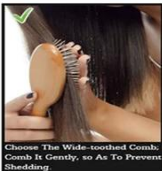
Choose The Wide-toothed Comb; Comb It Gently, so As To Prevent Shedding.