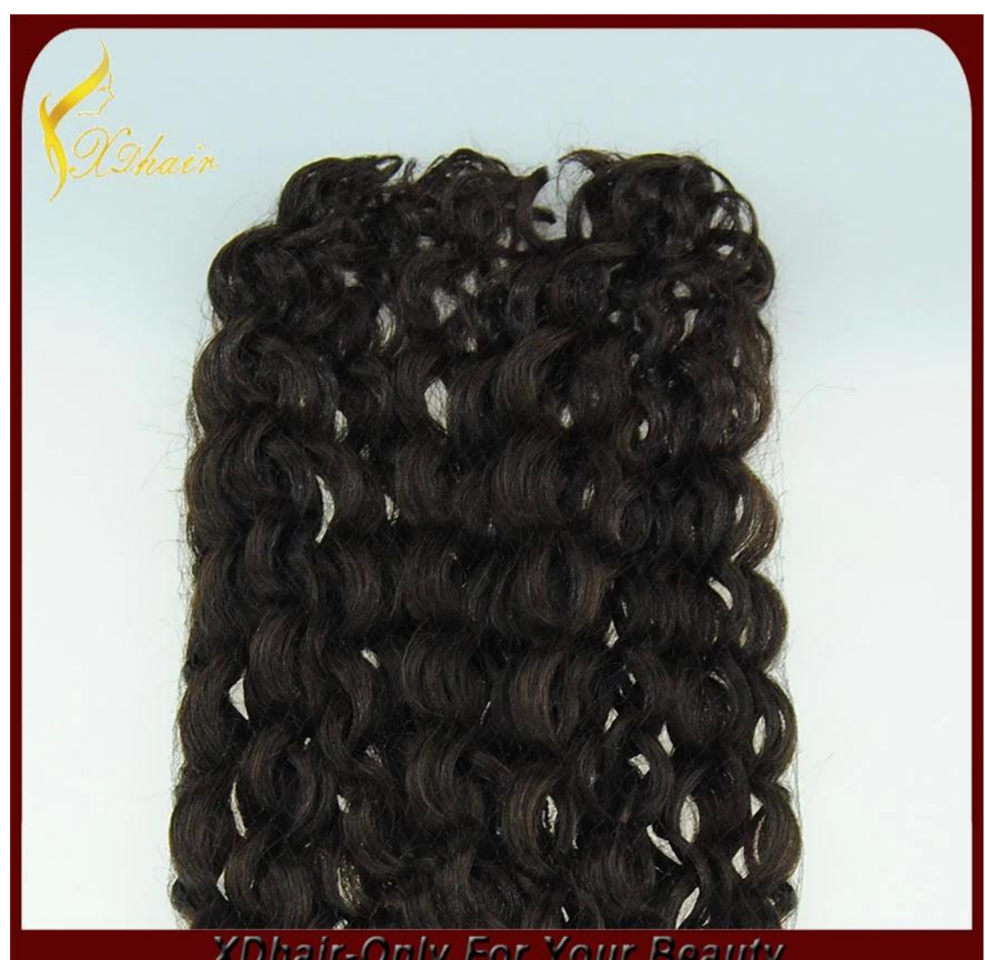
XDhair-Only For Your Beauty