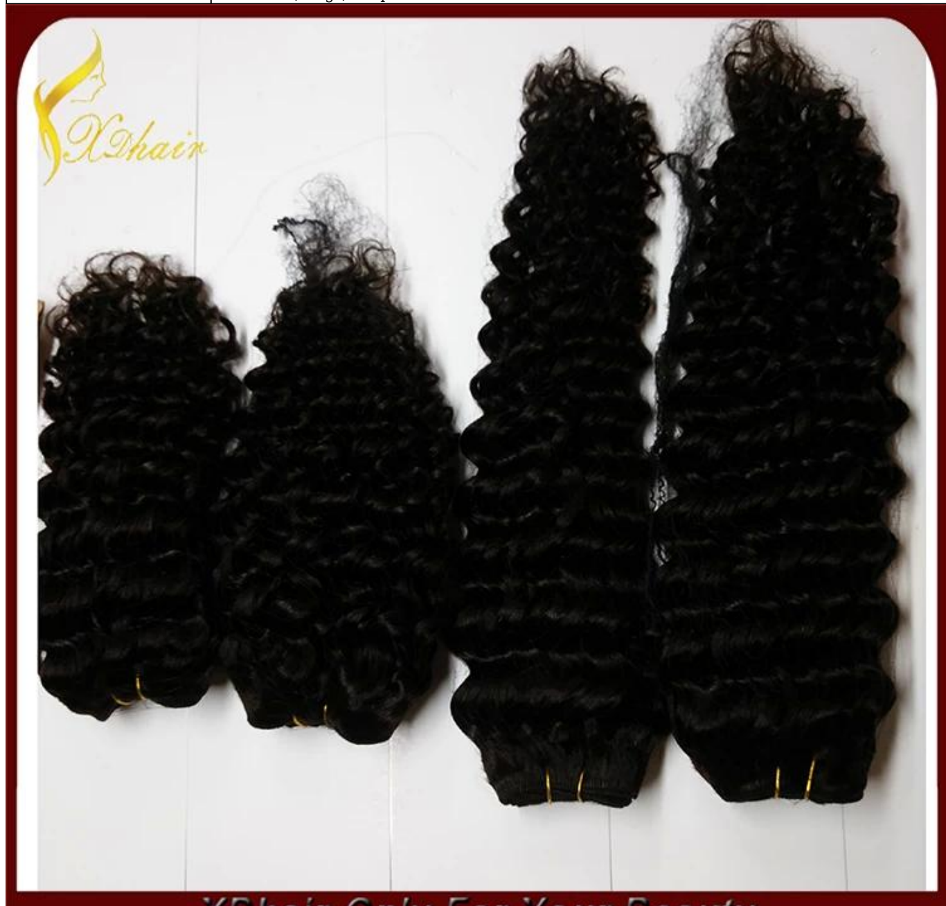
XDhair-Only For Your Beauty