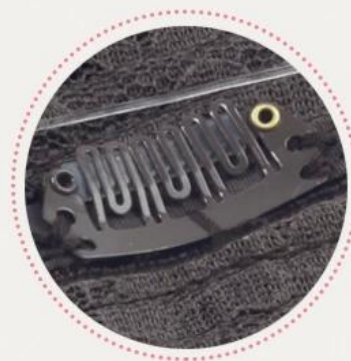
STAINLESS STEEL CLIP