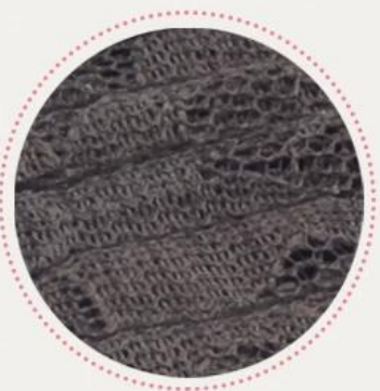
SOFT LACE BASE