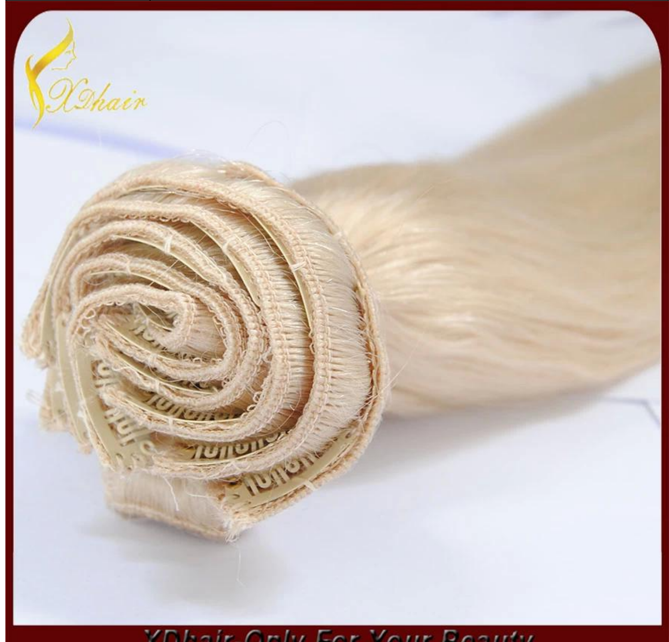
XDhair-Only For Your Beauty