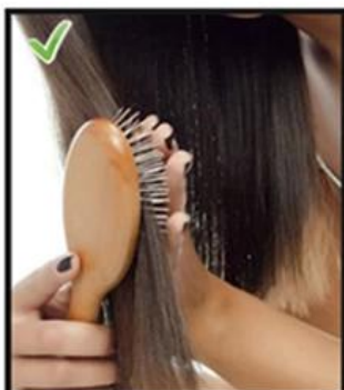
Choose The Wide-toothed Comb; Comb It Gently, so As To Prevent Shedding.