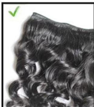
After Washing The Hair, please Nurse With Some Hair Oil, then The Hair Will Be Silky And Soft.

Secondly, After wash pls nurse the hair with some hair oil, then the hair will be silk and soft.