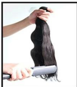
Too Much Heat May Damage The Hair.