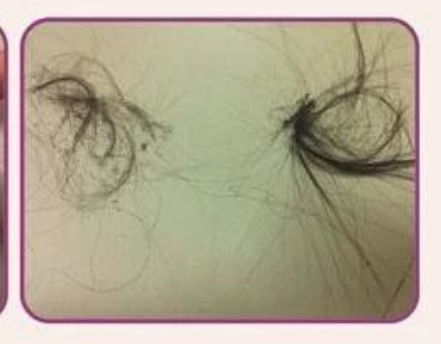
Human Hair: Burning smells like a burnt fragrance, human hair burns out very quickly, and feels like coke, It also easily becomes ash.