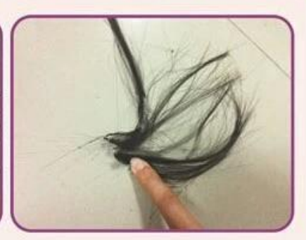
Synthetic:Burning smells like a burning plastic, there is a small flame, and feels viscous when it burns out.