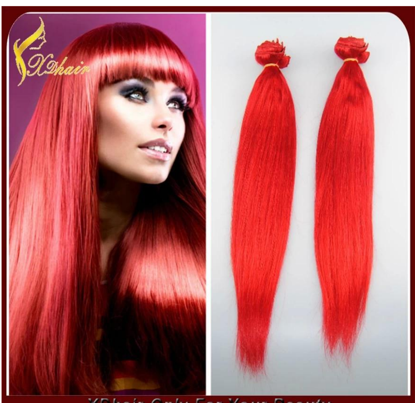
XDhair-Only For Your Beauty