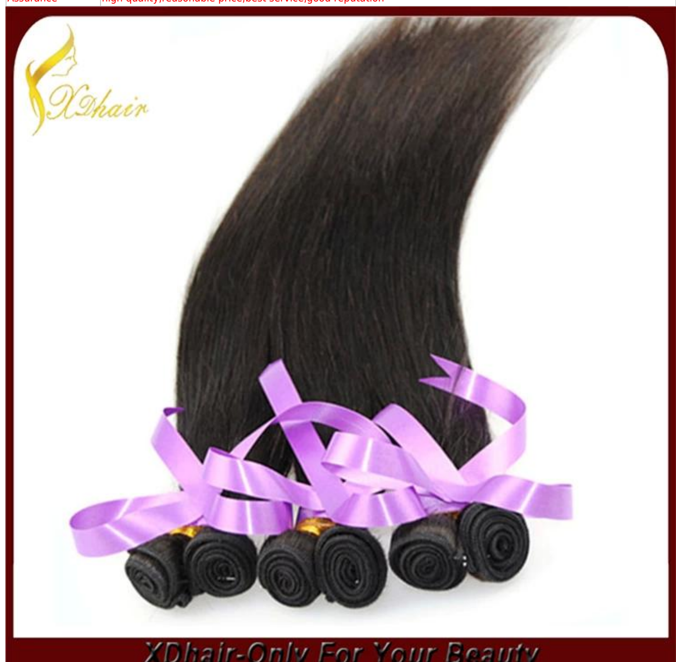
XDhair-Only For Your Beauty