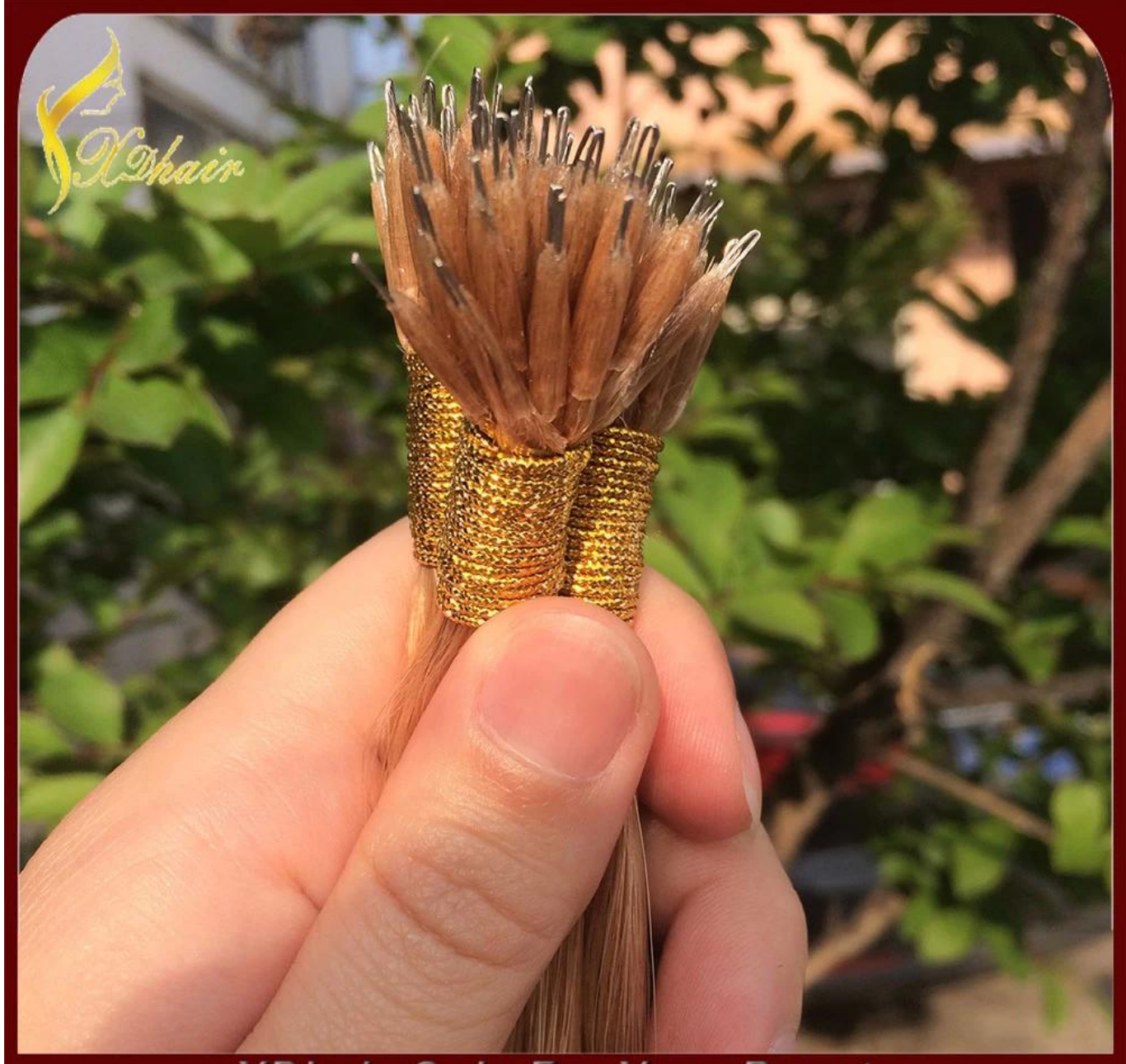
XDhair-Only For Your Beauty