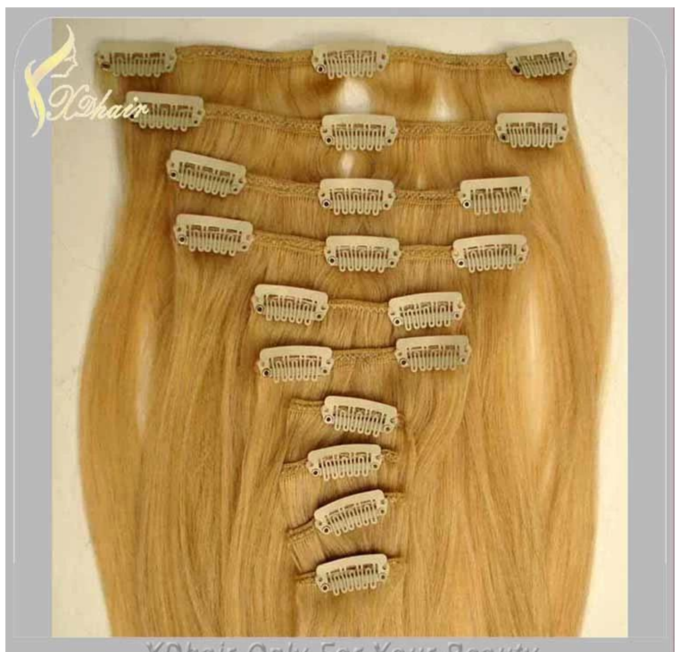
XDhair-Only For Your Beauty