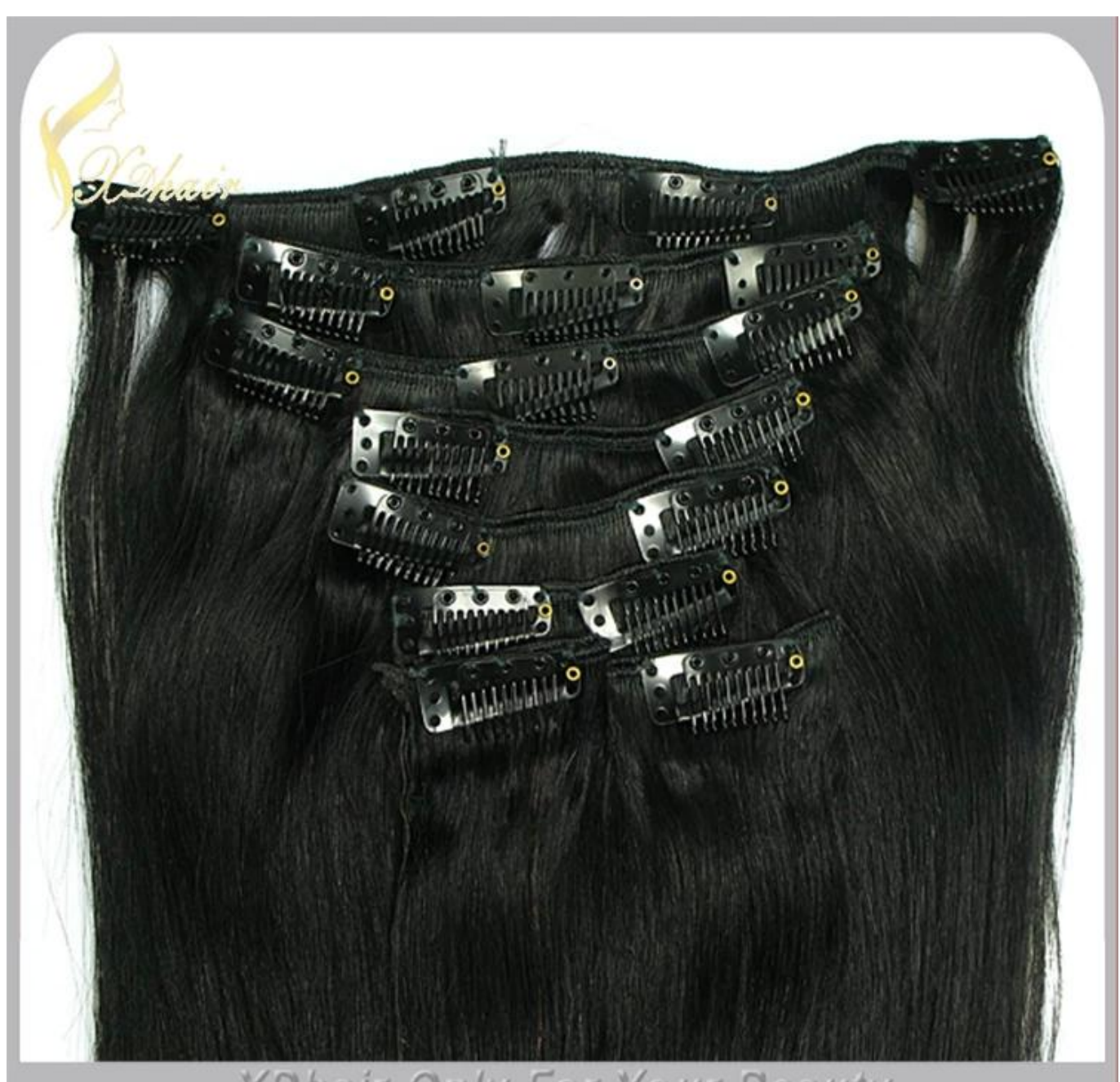
XDhair-Only For Your Beauty