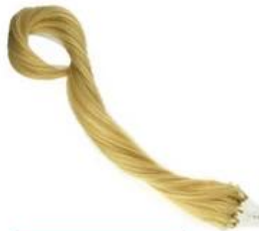
Micro ring hair