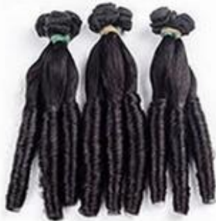
Funmi hair 2