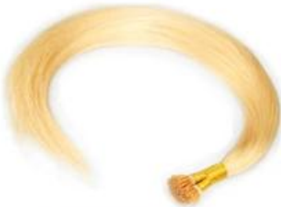
I tip Hair