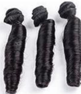
Funmi hair 4