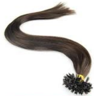
U tip Hair