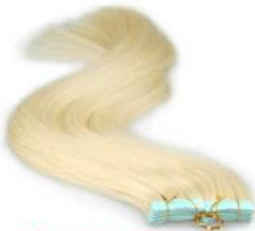
Tape in Hair