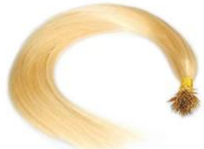
Nano tip hair