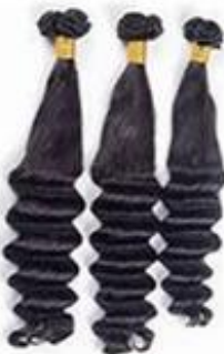
Funmi hair 1