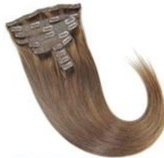
Clip in Hair