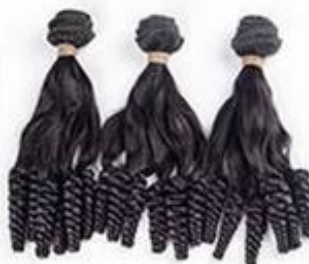
Funmi hair 3