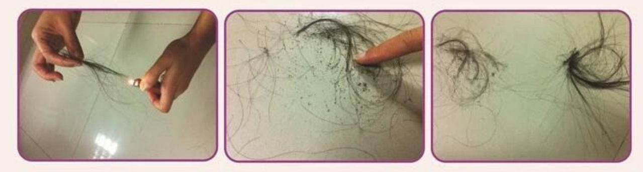
Human Hair:Burning smells like a burnt fragrance,human hair burns out very quickly,and feels like coke,It also easily becomes ash.

Synthetic:Burning smells like a burning plastic,there is a small flame,and feels viscous when it burns out.