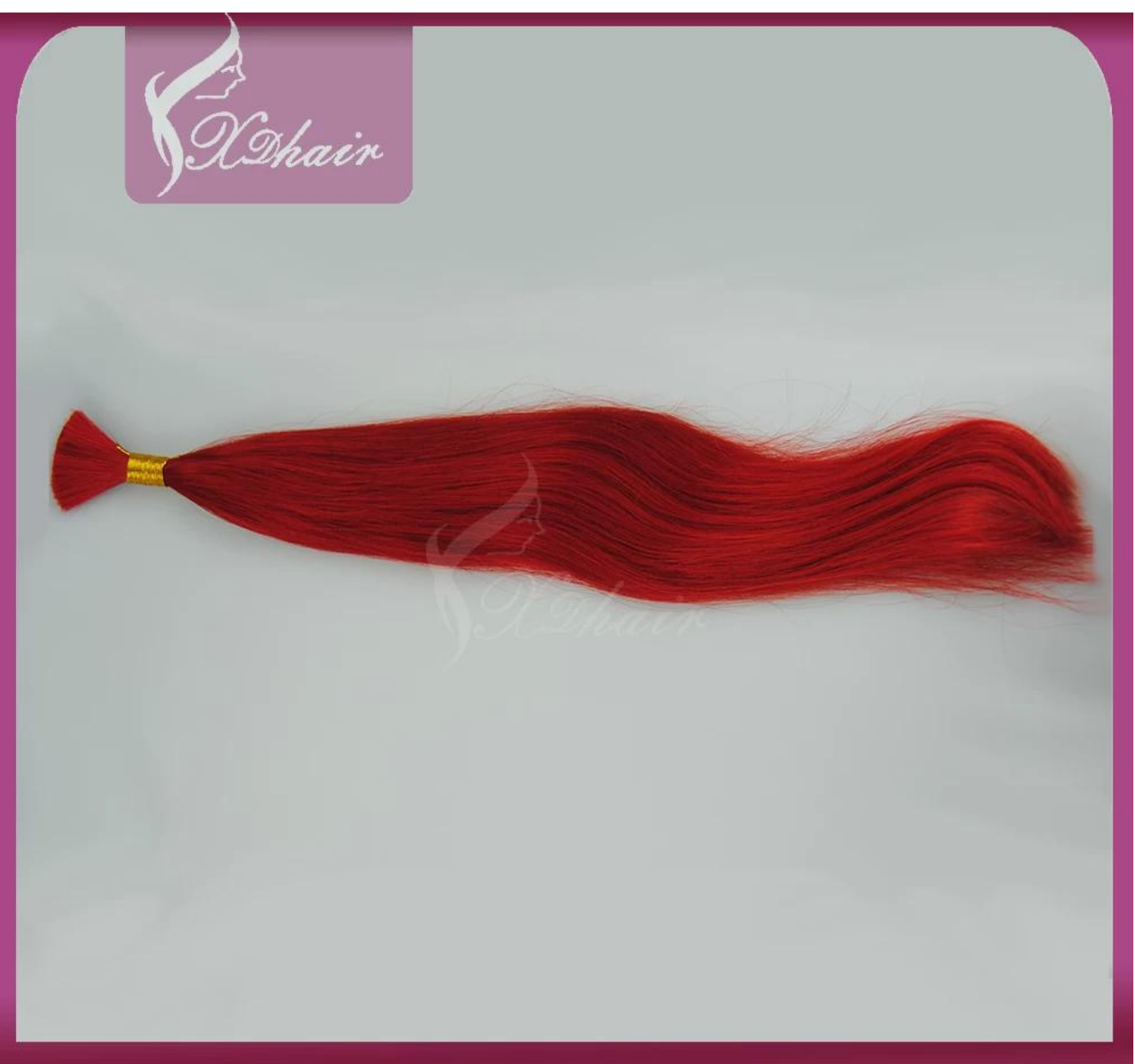
XDhair-Only For Your Beauty