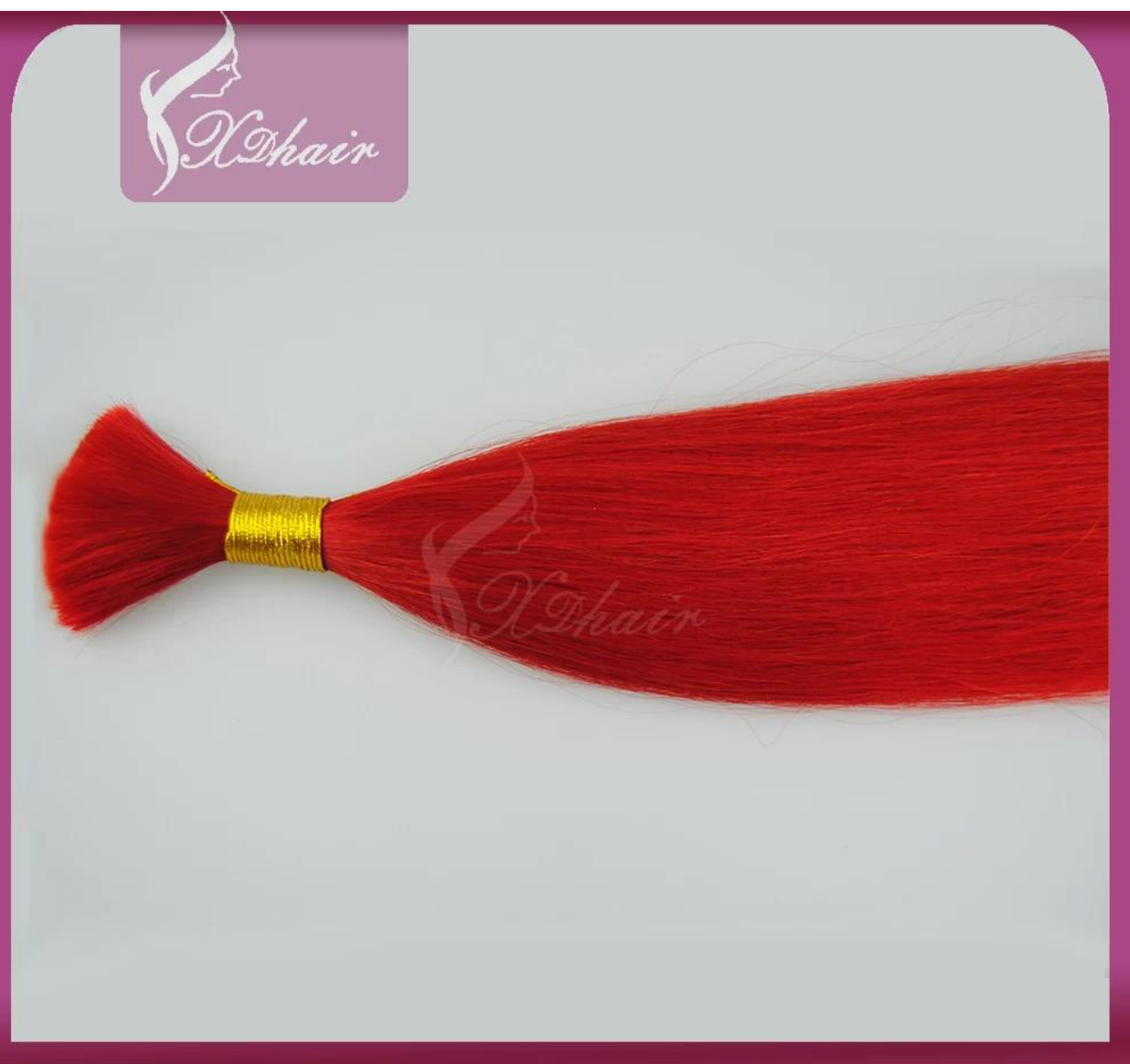
XDhair-Only For Your Beauty