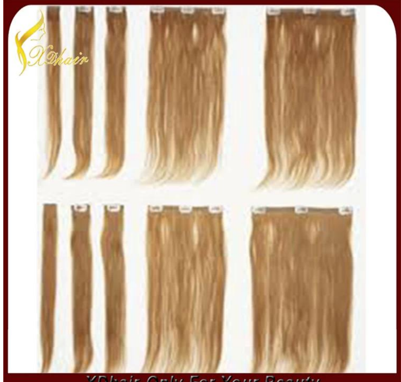
XDhair-Only For Your Beauty