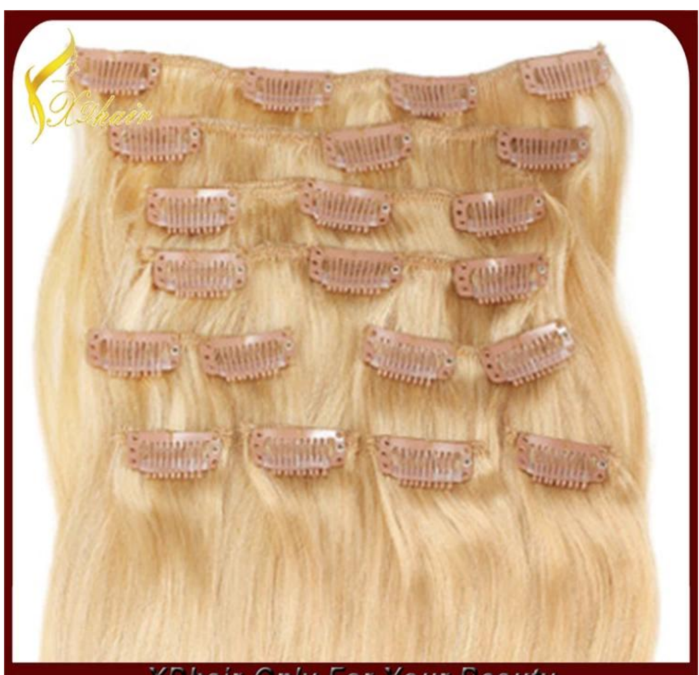
XDhair-Only For Your Beauty